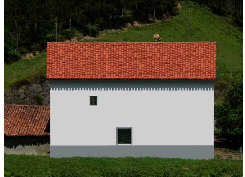
Barn, North Spain