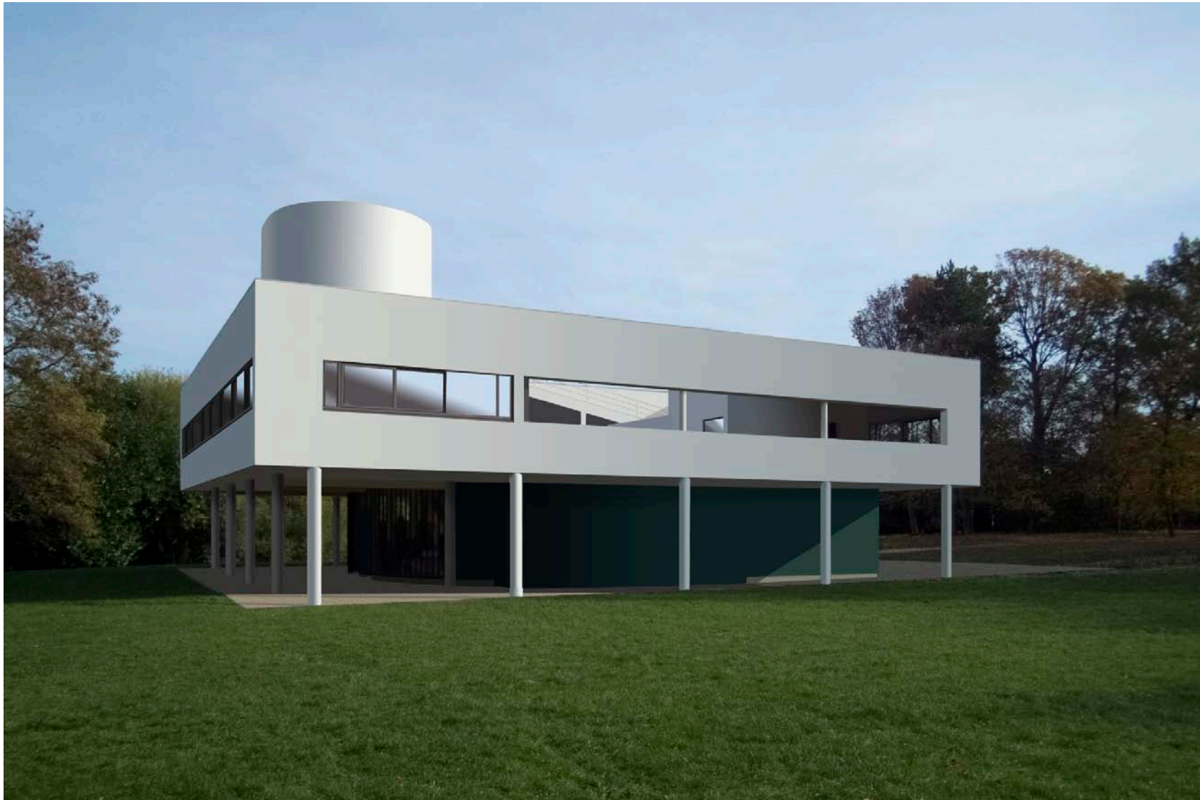
Villa Savoye, Paris