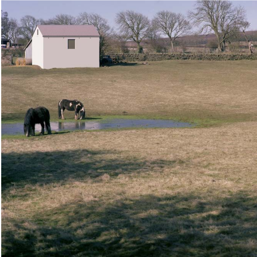
Teessdale, North Yorkshire