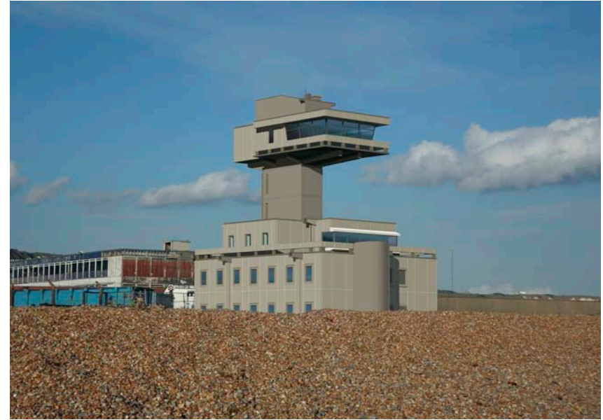
↗ Pilot Tower, Folkestone.