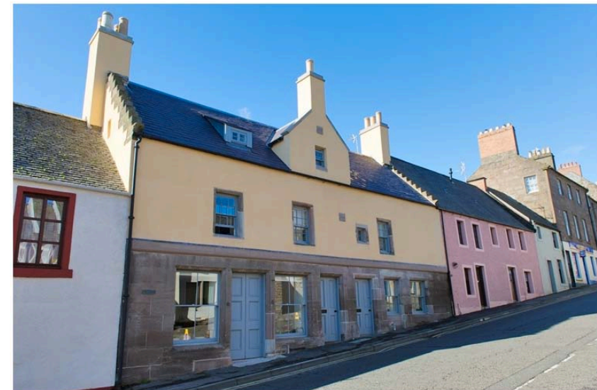
Fig . 2 Merchants House, Brechin after works (2012)