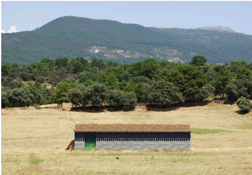
↖ Garage, Spain.