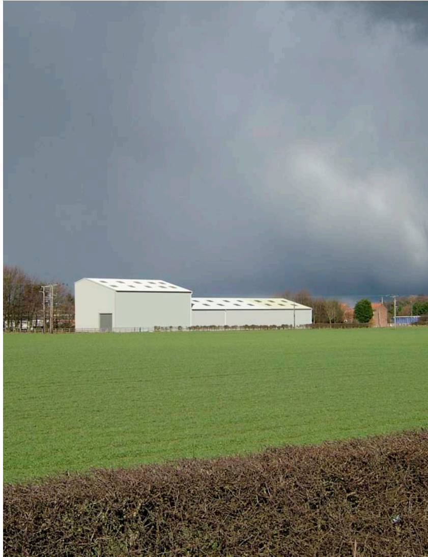
Shed nr A66, Teesside