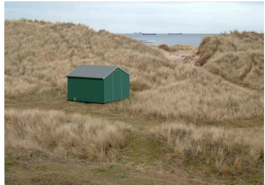
→ Firshermans shed, Redcar, Teesside