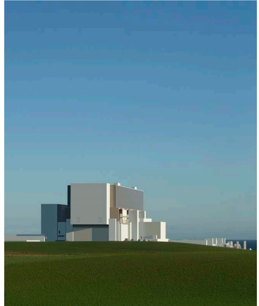
Torness Nuclear Power Station, East Lothian