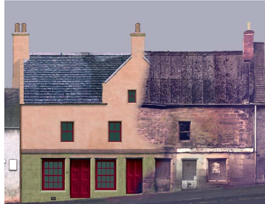
Fig.1 The Merchant's House, Brechin, for TBPT. © 1999 David Kinney

Digital prints on art paper.. Each approximately A2/A3 finished size.